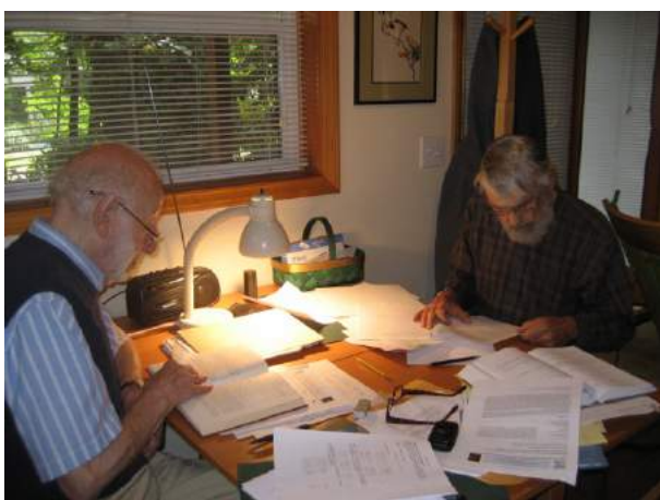
Ingram and Al at work in Seattle, August 2015

And so began their legendary, 58-year collaboration. First and foremost must be noted their landmark treatise on majorization [4], in which they show how many, if not most, classical inequalities, such as the arithmetic mean/geometric-mean inequality, Hadamard’s inequality for the determinant of a positive definite matrix, isoperimetric inequalities for convex polygons, and entropy inequalities, all arise in the unified framework of majorization. Their statistical applications of majorization included the unbiasedness and power monotonicity of multivariate hypothesis tests, concentration inequalities for sums of independent random variables, and bounds for the probability of correct selection of the largest cell probability in a multinomial distribution or the largest population mean based on a sample from independent univariate distributions. We estimate that over three thousand papers citing the first and second editions of [4] have subsequently appeared.